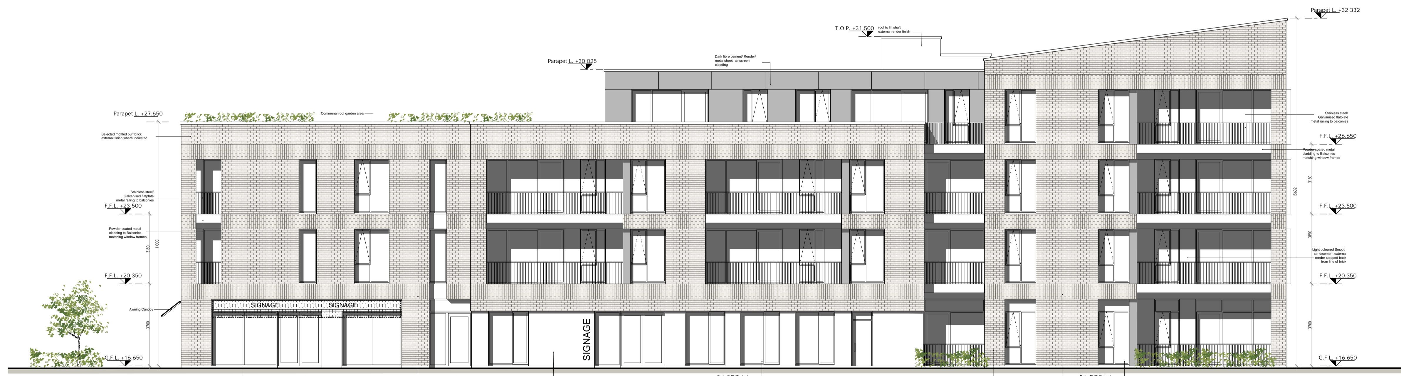
01 East Elevation Scale 1:100