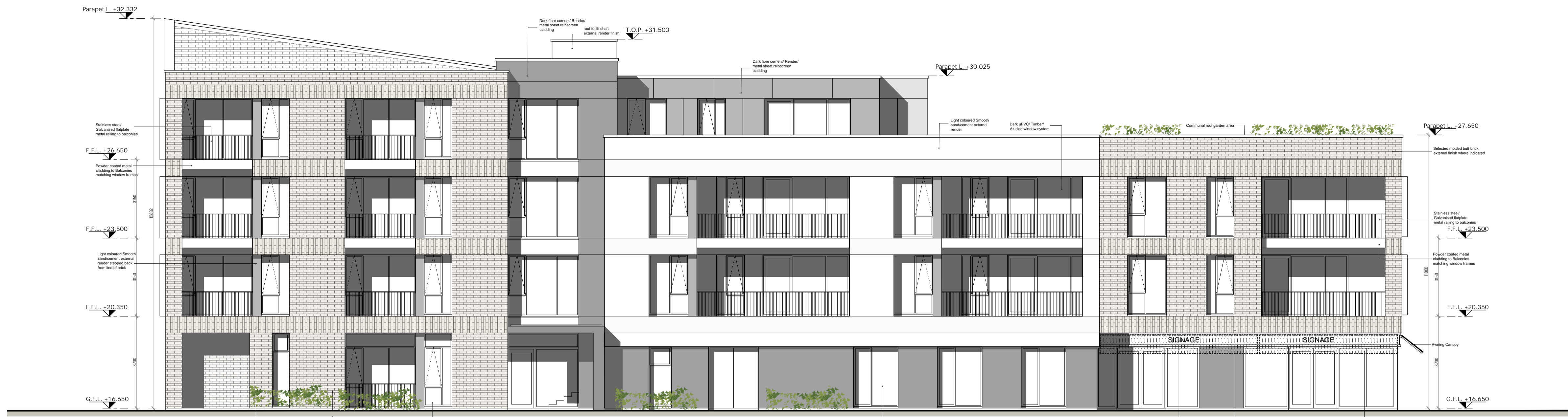
01 West Elevation Scale 1:100